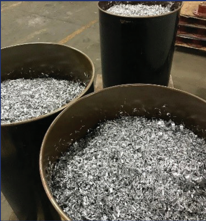
Scrap metal to be recycled