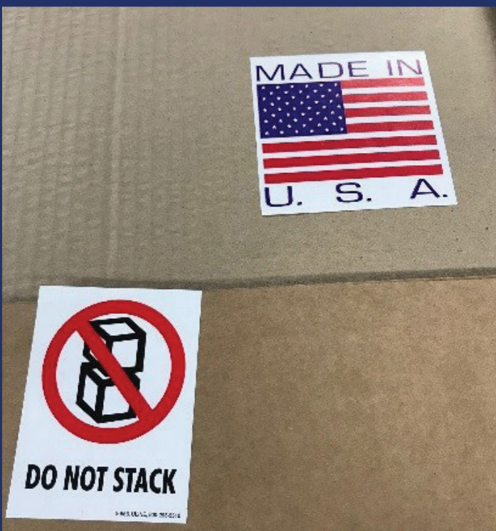
Proudly made in the U.S.A.